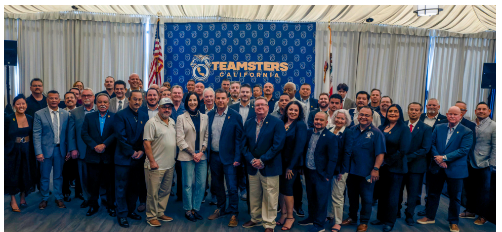
Teamster leaders from across California met in Sacramento for statewide candidate endorsement interviews.

In our efforts to push our workers-first agenda in California, we also held our first ever Teamsters California candidate interviews. Teamsters Joint Council 7 and Joint Council 42 collectively represent 250,000 Teamsters in California. This was an opportunity for us to gather together to meet with candidates who are seeking to run for statewide office. We were able to ask questions about automation and AI and the impacts it has to our jobs, education and funding issues, how to hold companies like Amazon accountable, and how candidates would make California more affordable for everyday working people. We had real conversations about how decisions made