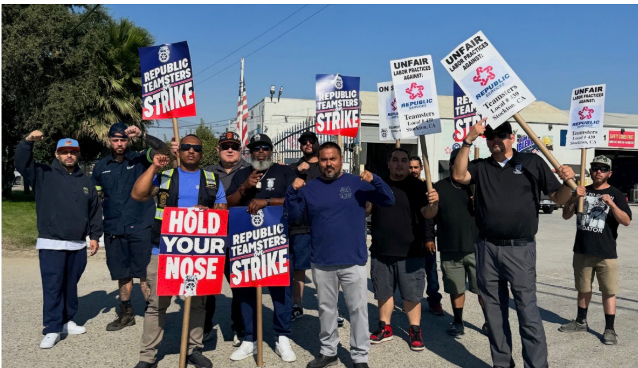
Local 439 Republic Services Teamsters in Manteca struck the company in July, ultimately prevailing and winning a strong first contract.

Over 500 Republic Services Teamsters from five locals nationwide—including a unit of Joint Council 7 members in Manteca, Calif., represented by Local 439—were forced to launch an enormous sanitation strike this summer after the multibillion-dollar waste corporation committed unfair labor practices.