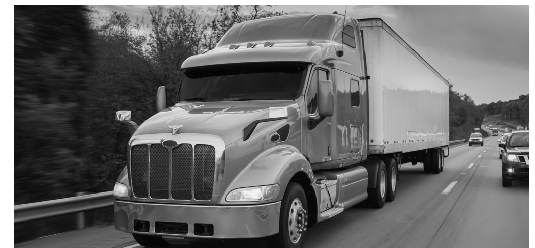
More than 400 drivers in the Western States were taken out of service for failing the FMCSA English language proficiency test.

questions in English if approached by an inspector. Using notes, cue cards, or smartphone apps to assist in talking to inspectors is not permitted so drivers need to be ready to talk without reading off anything.