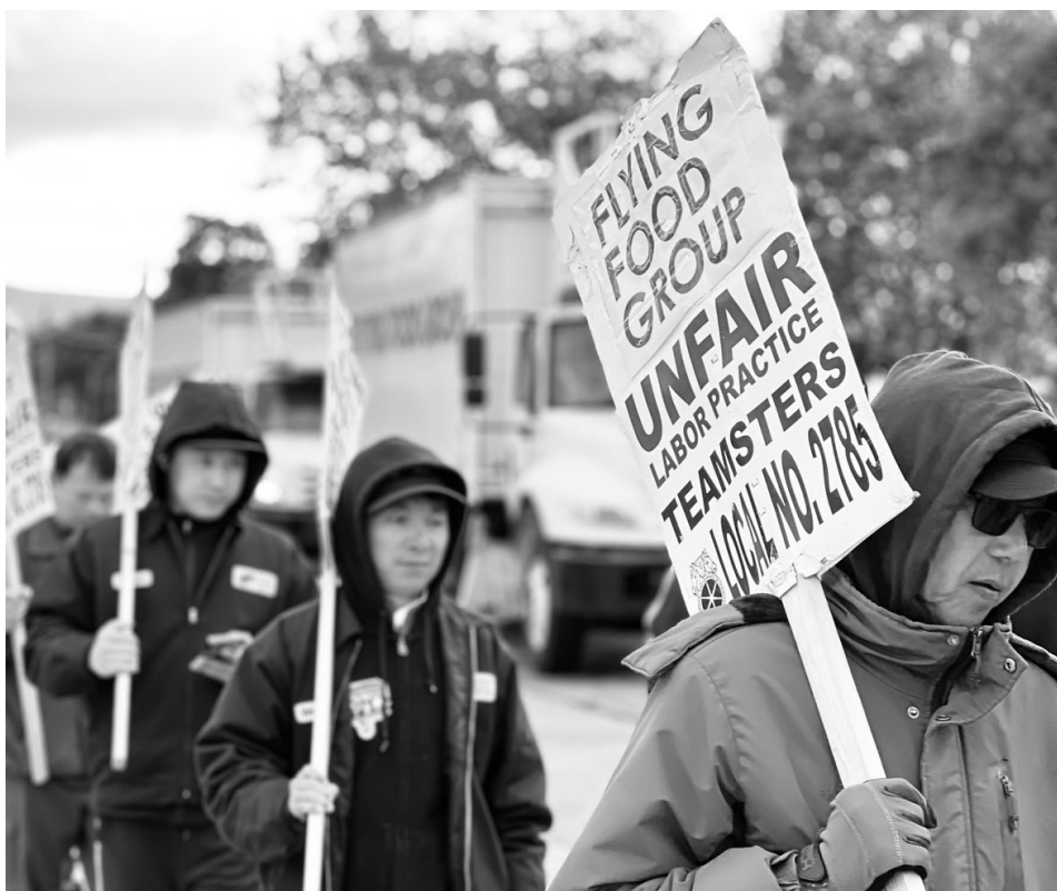
Local 2785 Flying Foods Group Teamsters withstood near-freezing temperatures, relentless rain, and punishing winds on their 24-hour, 62-day picket line.