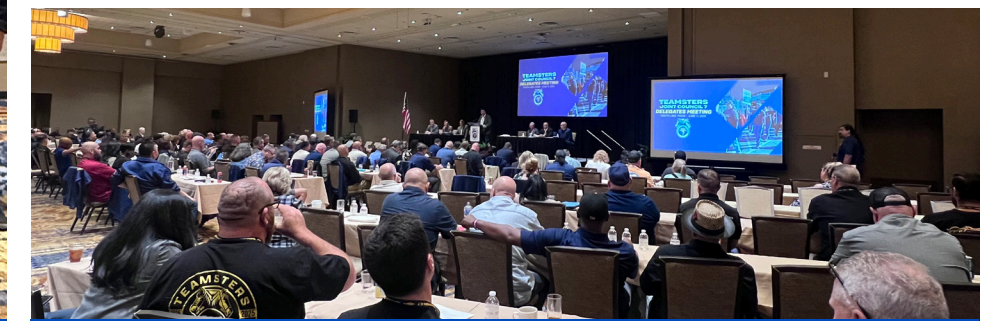
Nearly 300 Joint Council 7 Teamsters attended the 2025 seminar.

In his keynote address at the annual Teamsters Joint Council 7 Seminar in June, U.S. Representative Ro Khanna voiced his support of Teamster-backed legislation that protects workers and road safety by requiring a human operator on autonomous delivery vehicles.