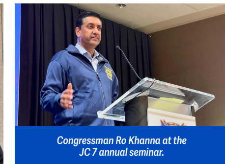
Congressman Ro Khanna at the JC 7 annual seminar.