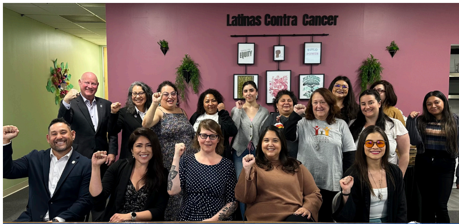
Latinas Contra Cancer members joined Local 853 in April.