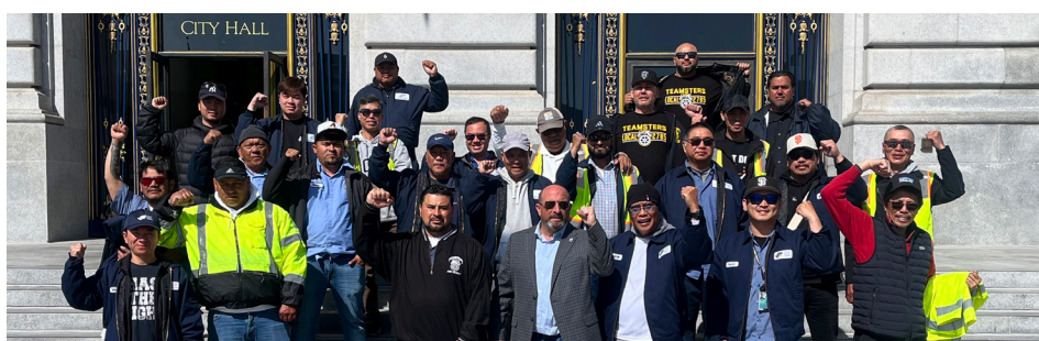
Flying Foods Group Teamsters took their fight to San Francisco City Hall.

W ith their unshakable resolve, Flying Foods Group Local 2785 members have won a robust new contract that leads the industry after outlasting management in a 62-day strike.