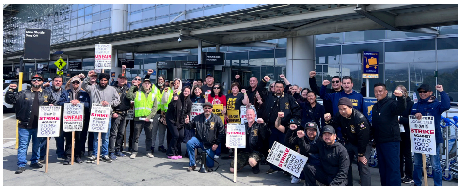
Joint Council 7 Teamsters and labor allies rallied with Flying Foods Teamsters on their picket line at San Francisco Airport.