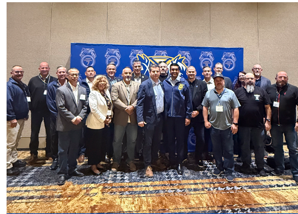
Congressman Ro Khanna with leaders from every Local Union in Joint Council 7.