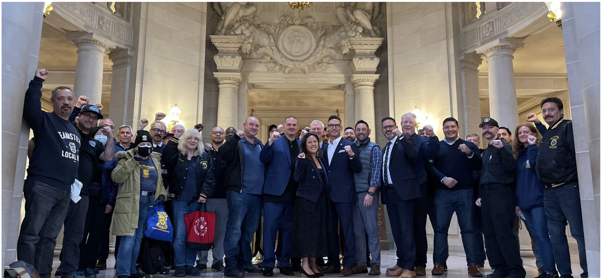
Teamsters celebrate after the San Francisco Board of Supervisors voted unanimously against Waymo in its expansion efforts.

Autonomous Vehicle Company Caught in a Lie at Board of Supervisor's Meeting