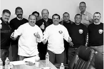
New members at Mi Pueblo celebrate their new contract, ratified in March, 2015