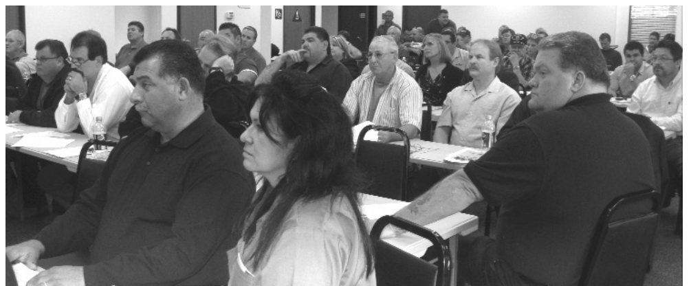
Delegates from all the Locals attend the first merged Joint Council 7 delegates meeting on February 17, filling Local 853’s San Leandro meeting hall.