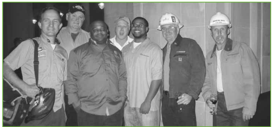
Here are some of the rank-and-filers who helped take over San Francisco City Hall for the 100th Anniversary celebration. This group came from Locals 70, 853 and 896.