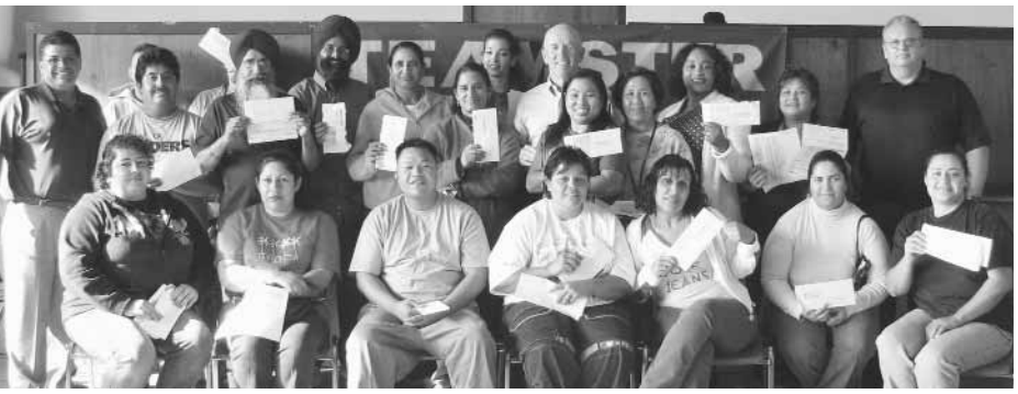
A group of the TGCAS employees proudly hold up their settlement checks.

The grievance centered on the seniority dates for members hired from a temporary employment agency. Historically, the company had based their seniority date as the first date of employment as a temp. However, when the company ended this practice in early 2004, the union filed a grievance.