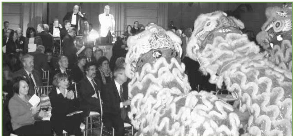
The 100th Anniversary Celebration program was opened by dragon dancers and closed with music by the Rex Allen America Swings Again band.

Happy One Hundred, Joint Council 7 Teamsters!