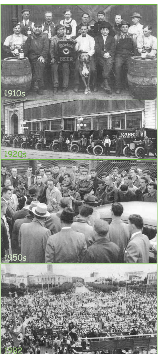
From top: Early Teamster beer drivers; Local 70 department store drivers in Oakland; the 1953 UPS organizing drive; 1982 Labor Parade brings 70,000 workers to San Francisco.

Important notice to Participants and Beneficiaries of the Teamsters Life With Dues Benefit Plan