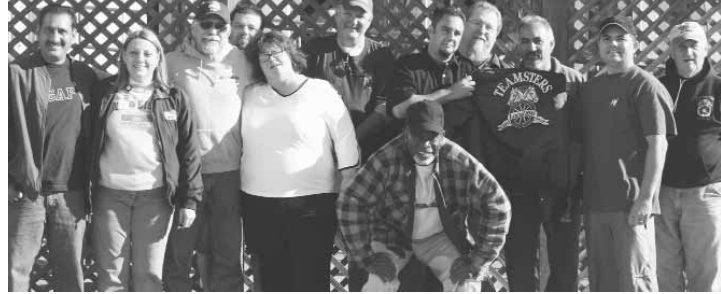
The "Families Helping Families" organizing committee, shown after the group prepared 120 gift boxes of food.

On Saturday, November 17, about 100 Local 896 members and friends got together at the Anheuser-Busch Fairfield warehouse to sort food into gift boxes to give to 120 families in