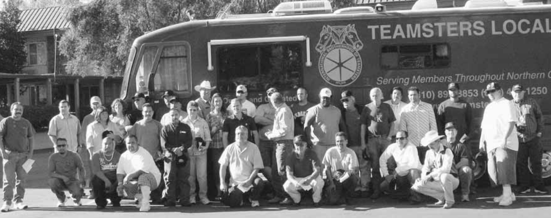
Reliable drivers join Local 853 after ratifying their first contract in October.