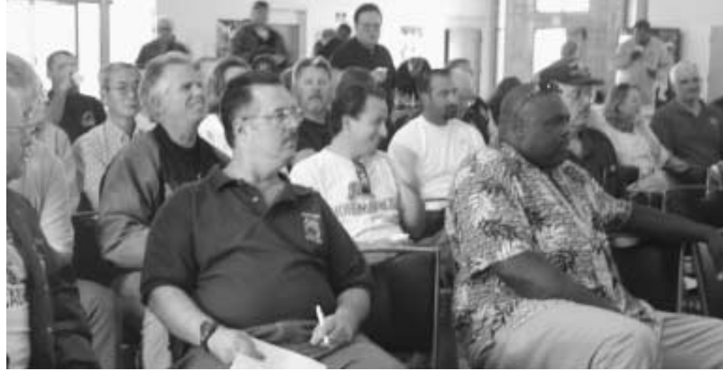
Members from every Local Union in Joint Council 7 met at Local 70 to learn about the anti-union propositions and begin work to fight them.

providers are subject to the regulation of the Public Utilities Commission, and that those providers have the certainty they need to make sure we have adequate supplies of electricity in the future.