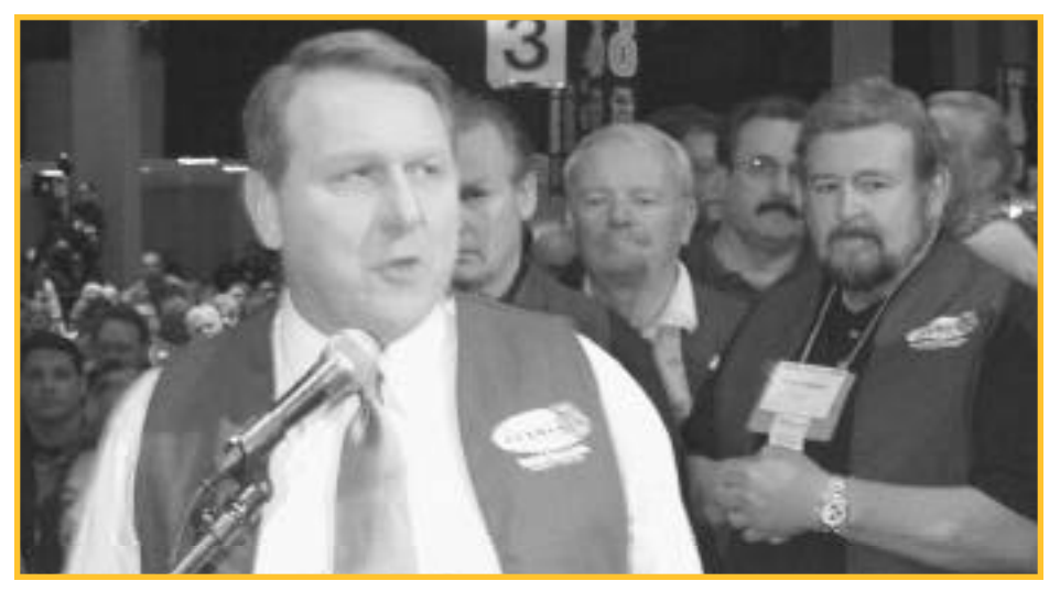
President Hoffa goes to the Convention floor to 'call the question' as blue-vested delegates prepare to vote on the recommendations of the Blue Ribbon Commission.

The Commission recommended several changes that will allow the In-