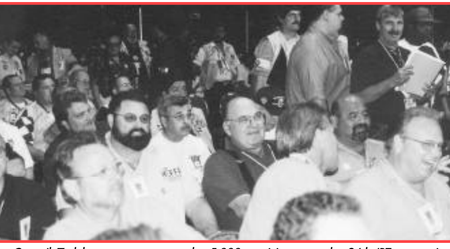
Joint Council 7 delegates are among the 5,000 participants at the 26th IBT convention