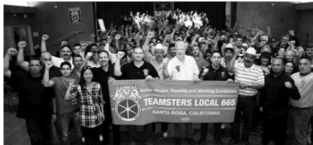
Over 400 solid waste and recycling workers have begun a drive to become Local 665 Teamsters.

Solid waste and recycling workers in Sonoma County currently work in 15 separate incorporated or county jurisdictions. Some of the contracts are currently up for bid, and the current employer is up for sale.