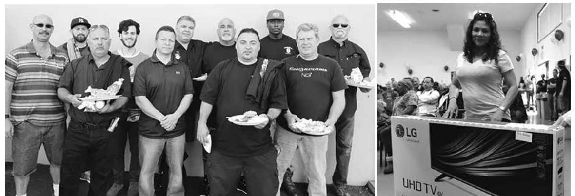
On March 11, Teamsters Local 287 celebrated its members in San Jose with lunch and a raffle. One lucky member took home a 55" flat screen TV.