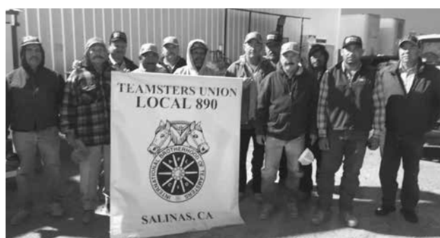
Local 890 members get information about the union as they attend the Taylor Farms orientation session.