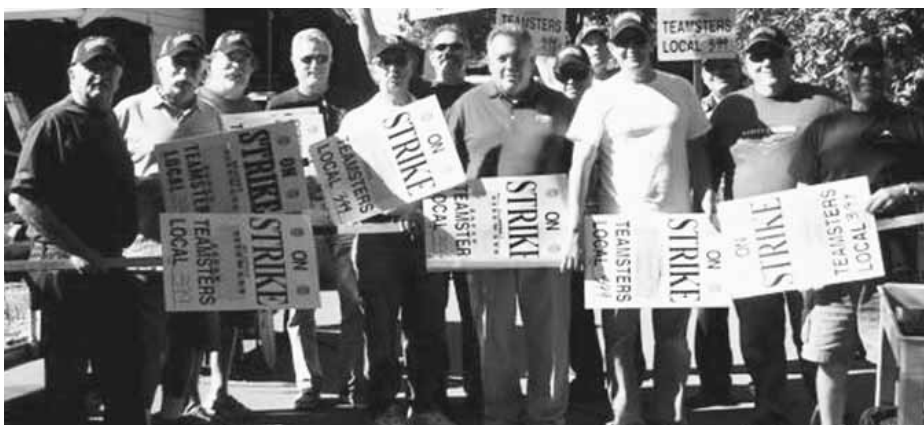
Teamsters from Locals 315, 624 and 399 hold their picket signs sideways to let the Japanese film company know that the drivers on this production should have a union agreement.

When Local 315 received word that the Japanese film "Sideways" was being set up and filmed in Calistoga, the Local contacted the production company to sign an agreement. But they refused.