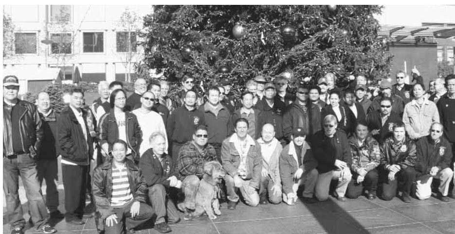
Local 665 members in the parking industry are pleased with their new four-year contract.

parking valets and garage workers will reach $21.46 an hour by the last year of the contract. Included in the new package are improvements for both the pension plan and the 401k.