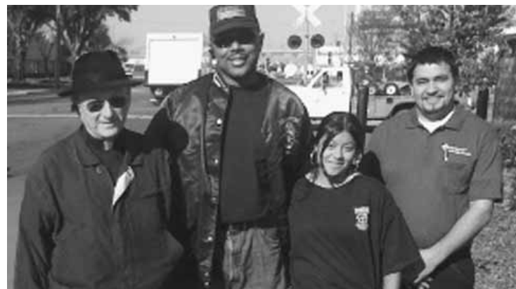
Employees at Stericycle look forward to becoming members of Local 70, as soon as their election is certified and contract negotiations can begin.

cruiting new organizers should be a top priority.