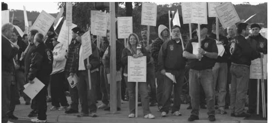
Teamsters picket GraniteRock's Contractor Expo in Seaside in January.

On a cold, crisp January 16, 2009 morning, Teamsters from Locals throughout the San Francisco Bay Area converged on GraniteRock's Contractor EXPO at the Embassy Suites Hotel in Seaside, California. The crystal blue sky and the deep blue waters of the Pacific Ocean paled in comparison to the intimidating wave