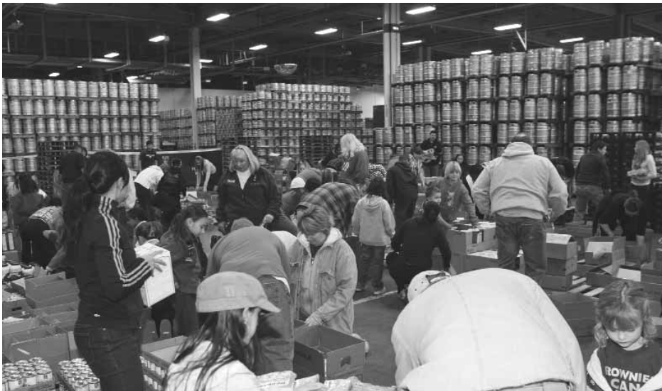
Teamsters 896 members package and deliver food for 150 families in Solano County.