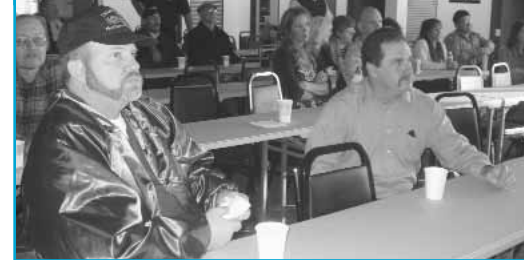
More than two million people went to the Washington Mall to be part of the historic event, when the first African-American became President, setting a new direction for American policy. (Inset) Local 853 members and staff gathered at the union's San Leandro meeting hall to watch the inauguration together.

strong middle class and it's good for rebuilding the economy."